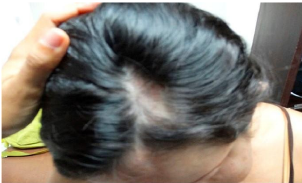
Figure 5. Photo of the patient. Note the partial alopecia in the vertex head region.

patients with epileptiform activities in the ipsilateral cortex of the affected hemiface. 7 Another neurological manifestation is migraine associated with cranial neuropathies that may be related to cranial nerves III to VII. Due to bone and other anatomical abnormalities, trigeminal neuralgia can be found in association with vascular inflammation with secondary facial pain, which is difficult to be treated pharmacologically. 8