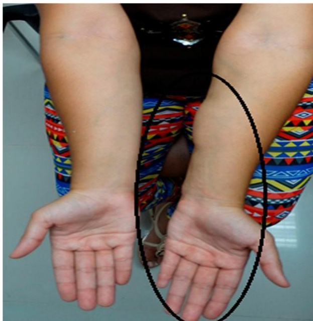
Figure 2. Photo of the patient. Note the abnormality of the left upper limb, especially of the forearm area.

The neurological characteristics are the most frequent manifestations of PRS, including cutaneous involvement. Epilepsy is one of the neurological characteristics that can be found in patients with PRS. Commonly, focal seizures with or without impaired consciousness originate in the ipsilateral cerebral cortex of the affected hemiface. A possible hypothesis is that the source of the seizure can be related to the role of chronic encephalopathy, observed in some